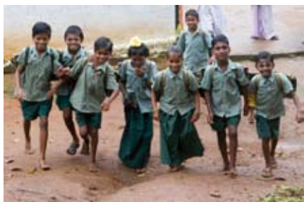
Kadayamalai school children

Nearly 70% of the Indian population - 390 million people - still lives in villages, mostly landless labourers and peasants, they continue to survive on less than 70p a day. Health care and education facilities continue to be abysmal in rural areas, driven by poverty, debt and the dream of a better future, migration to urban slums continues.