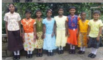
New clothes and shoes

They purchased clothes and shoes for all 150 children and gave them out at the children's Christmas party. Each girl received a dress or skirt and blouse and each boy received a sweatshirt or shirt and either long or short trousers; everyone received socks and shoes. The children loved their new clothes and especially the shoes, it's been cold in Thandigudi and the shoes keep their feet warm.