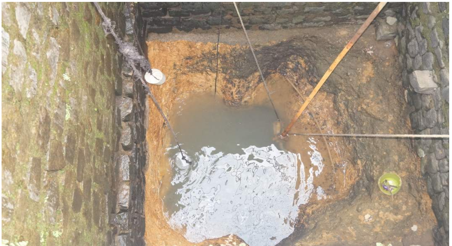
Rain bringing new spring in the well. This is the major source of conserve water for all purpose