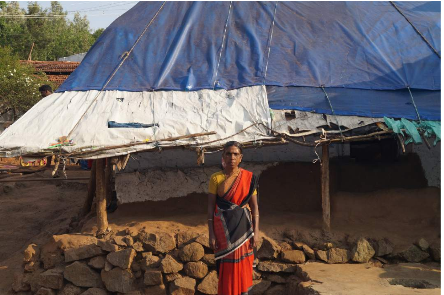
SAMPLE PICTURE OF LEAKING ROOF USED PLASTIC COVERS FOR DRAIN THE WATER