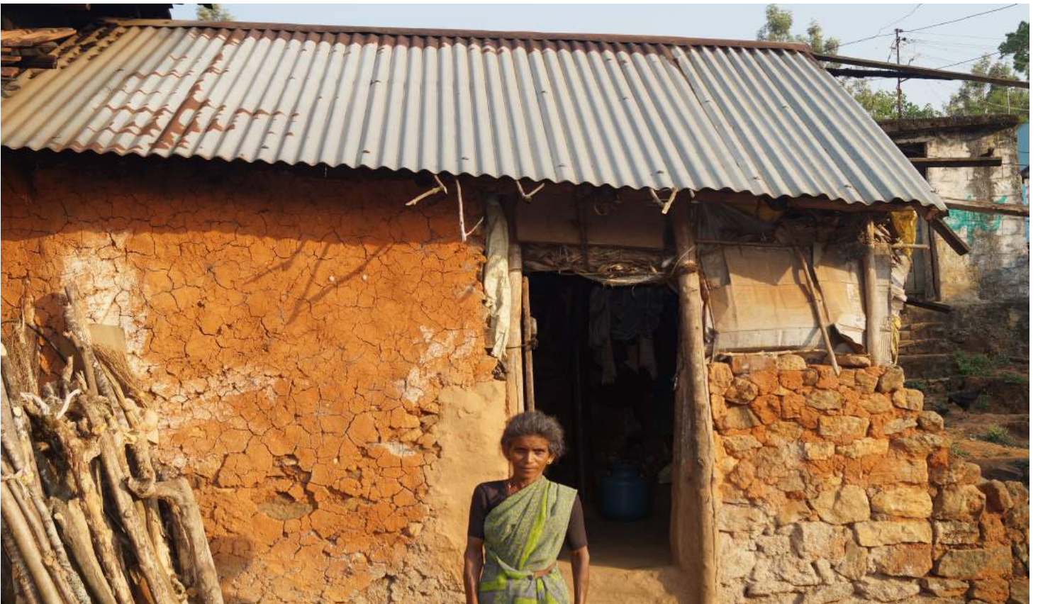
Lakshmi stand out of her mudded house, she lives this house with 3 children