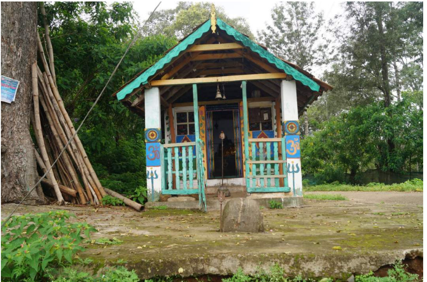
Nallukadu Village Temple. Once in two years they are celebrate a festival within the village and relations will be called to attend the functions and to share information between them and then they have a big feast.