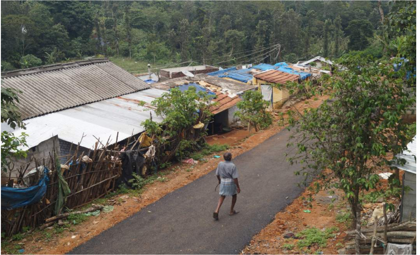
New built road passes through the Nallurkadu to next village