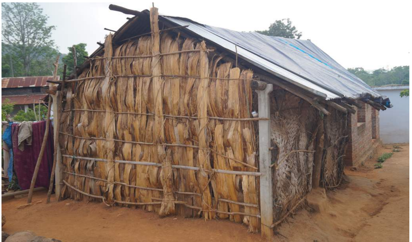
House build with Banana leaves or skin for wall besides and used coconut leaves in the frond or entrance